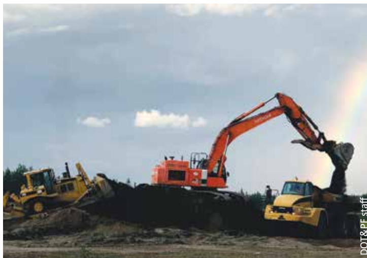
Galena airport reconstruction.

A Low scoring APEB projects are generally repackaged and brought back if conditions have deteriorated at the airport or the work scope can be modified to boost the score. With new (and potentially high scoring) projects entering the queue every year, low scoring projects may not be funded for a considerable time period. If your project received a low score, carefully consider your options for increasing the score. The APEB scoring criteria is available on the DOT&PF website at: https://dot.alaska.gov/stwdav/documents/APEB/CriteriaRevised10.1.10.pdf