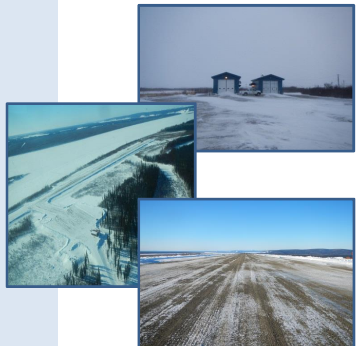
Left: Aerial of the Koyukuk Airport Top Right: SRE Buildings at the Napakiak Airport Bottom Right: Nulato Airport's Runway

Northern Region - Kaltag, Galena, Ruby, Tanana, Lake Minchumina, Bettles, Allakaket, Hughes, and Huslia