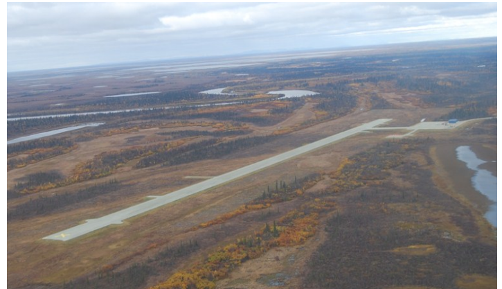
New airport for the isolated and remote community of Akiachak

The population of rural Alaska is primarily Native Alaskan. The remote, starkly beautiful land that we refer to as “rural Alaska” is simply “home” to the people who have inhabited the state for