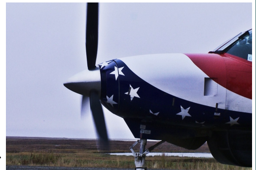
Aviation, the only year-round transportation system for America’s most remote residents.

Continued investment in aviation is critical to keeping rural Alaskans connected and preserving their lifeline.