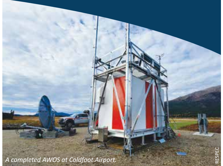
A completed AWOS at Coldfoot Airport.