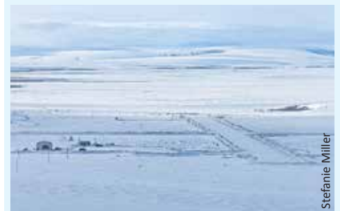
Snow-covered Deering Airport runway.

On April 10, 2024, the U.S. Environmental Protection Agency (U.S. EPA) finalized the first-ever national drinking water standard to protect communities from exposure to harmful per- and polyfluoroalkyl substances (PFAS), also known as 'forever chemicals.' The rule sets limits for five individual PFAS and mixtures of PFAS chemicals in public drinking water systems. It represents the most significant step to protect public health under EPA's PFAS Strategic Roadmap 3 and is expected to reduce PFAS exposure for approximately 100 million people. Read the full news release here . 4 PFAS have been used in aqueous film-forming foams (AFFFs) for fighting liquid fuel fires, including at airports, since the 1970s. Congress, the Department of Defense, the FAA, and the aviation industry are working to transition away from PFAS-containing AFFF to fluorine-free foam (F3). Learn more about the F3 Transition Plan for Aircraft Firefighting here . 5